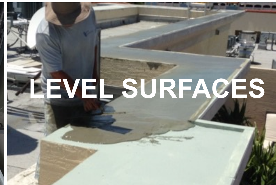
891493000 - Bulking Fiber # 5 Bag

BARRIERGUARD® + BULKING FIBER MIXTURE CAN BE USED TO FILL VOIDS, LEVEL SURFACES, AND CREATE CANTS, AS WELL AS MANY OTHER USES.