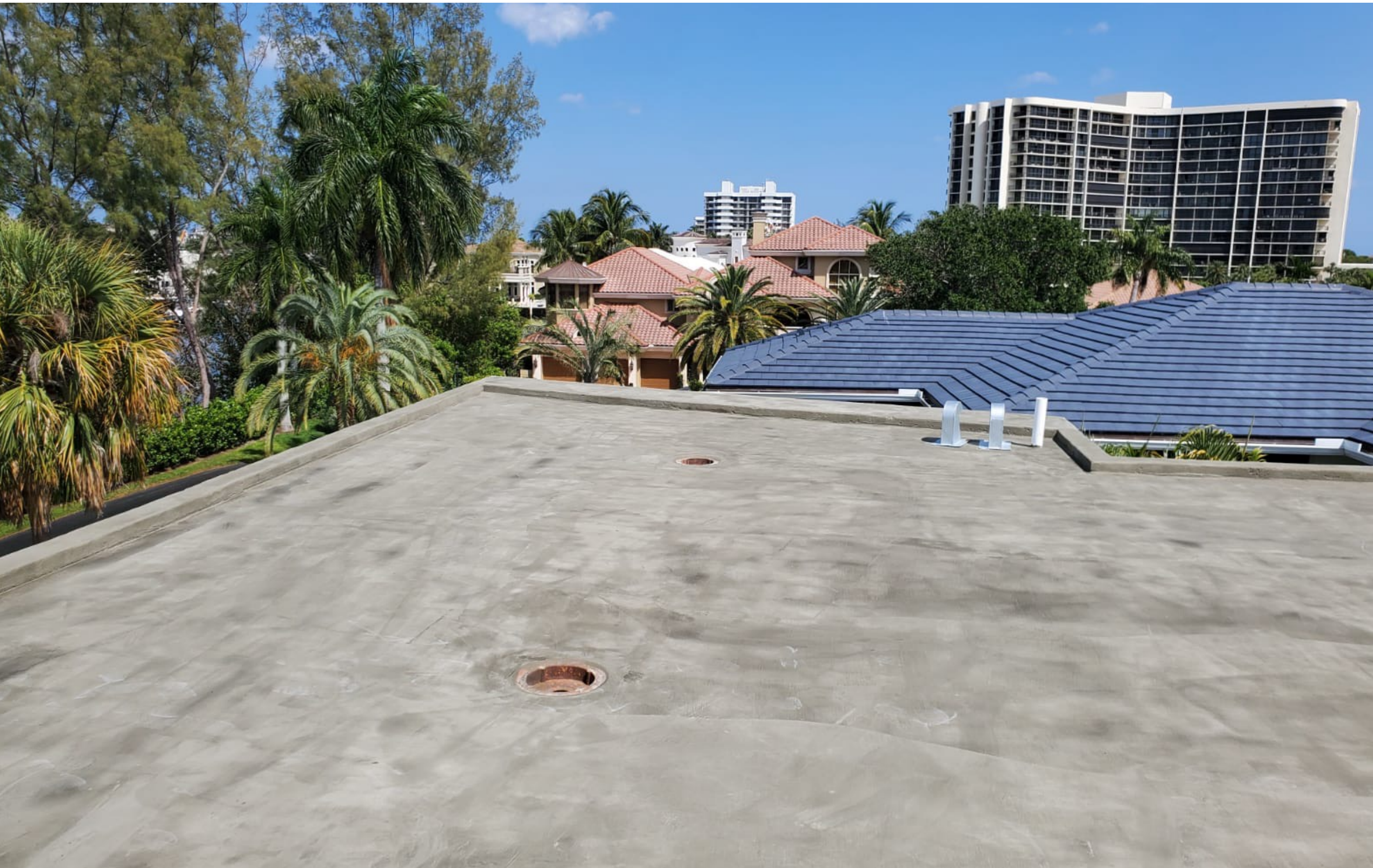
1 HOUR DRY TIME