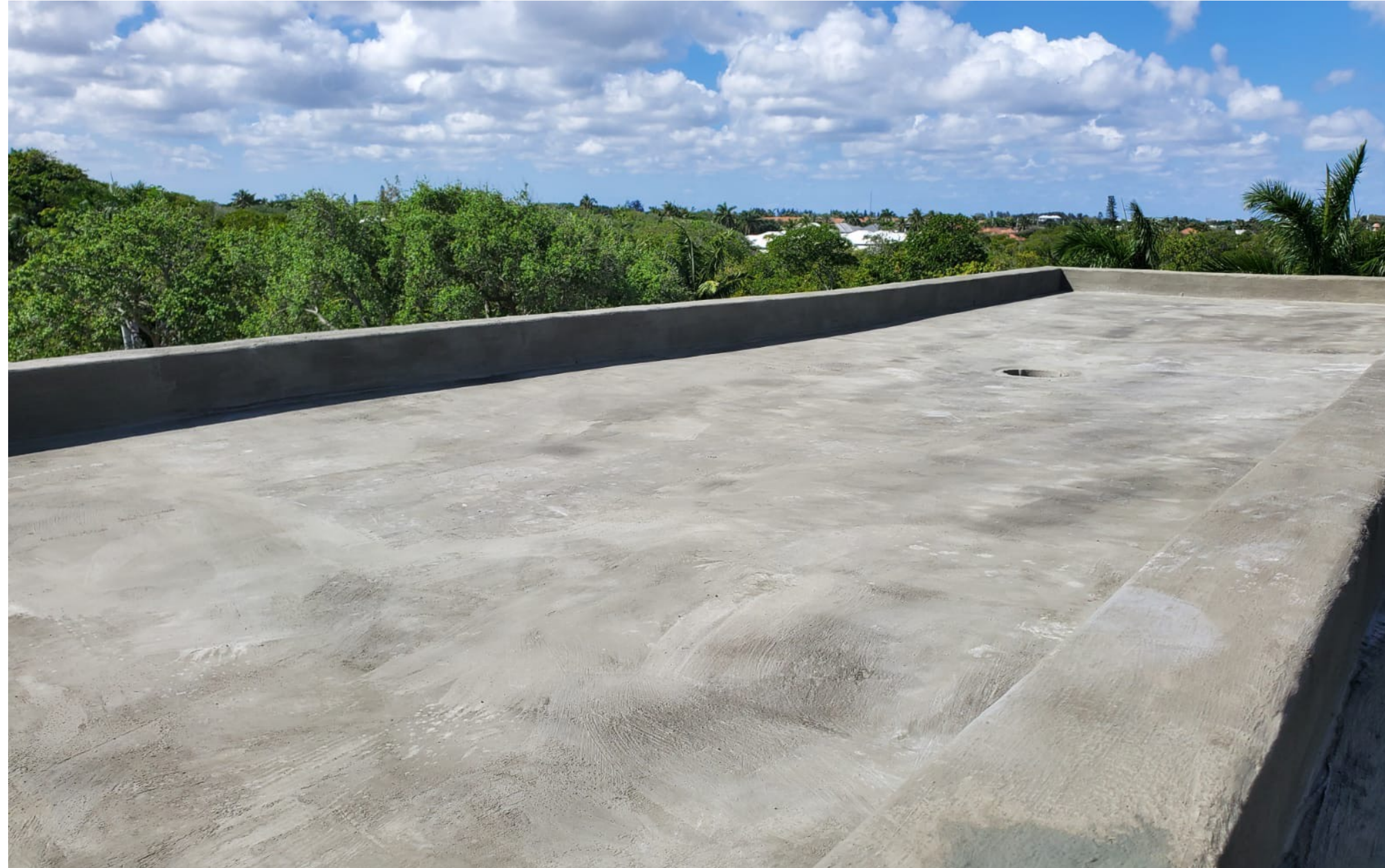
72 HOUR CURE TIME