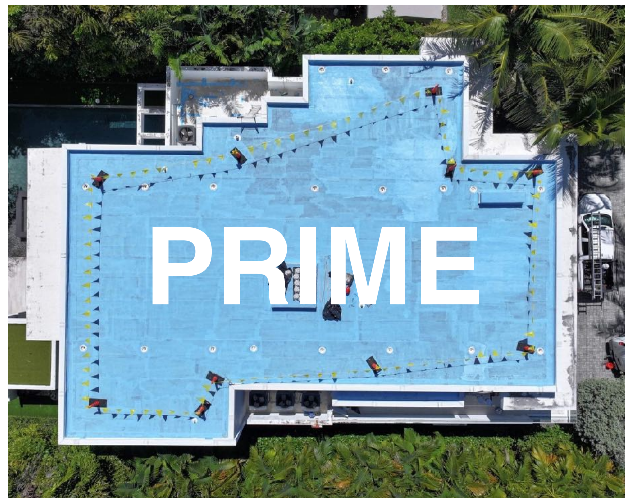
BLEED BLOCKING ON ASPHALT ROOFS