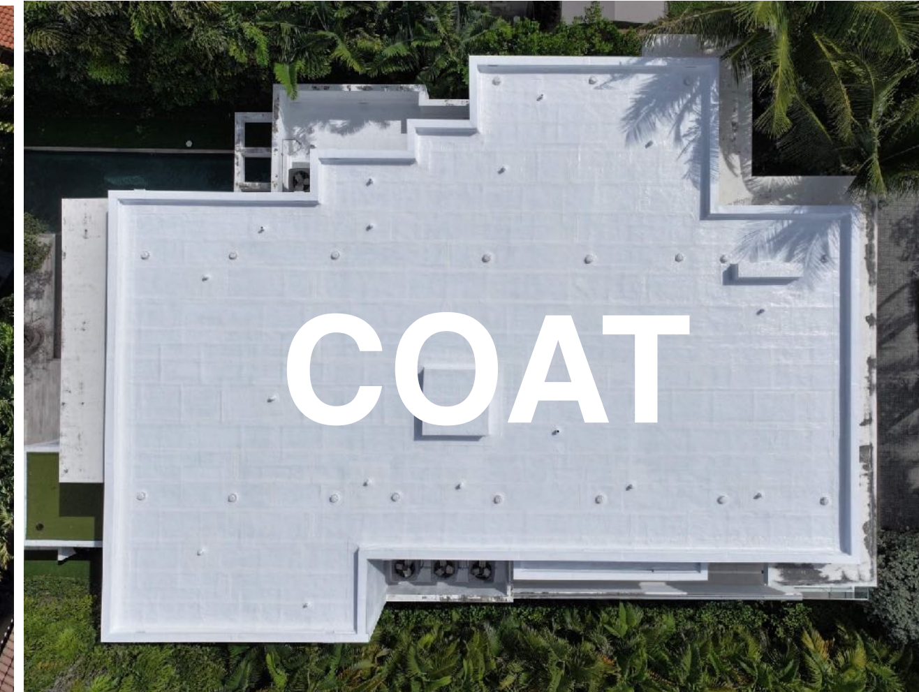
PONDING WATER RESISTANT