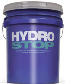
HYDROSTOP PRIMERS Shipped in blue pails with grey lids. Pails may have tint plug on lid. Primers available in 5-Gal and 2-Gal pails.