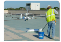
INSULATION & RECOVERY BOARDS

Note regarding coverage rates: the amount of coating required and number of coats is determined by duration and warranty specified. Coverage also varies with the specific substrate being coated; consult Technical Sales Representative for coverage rate guidance.