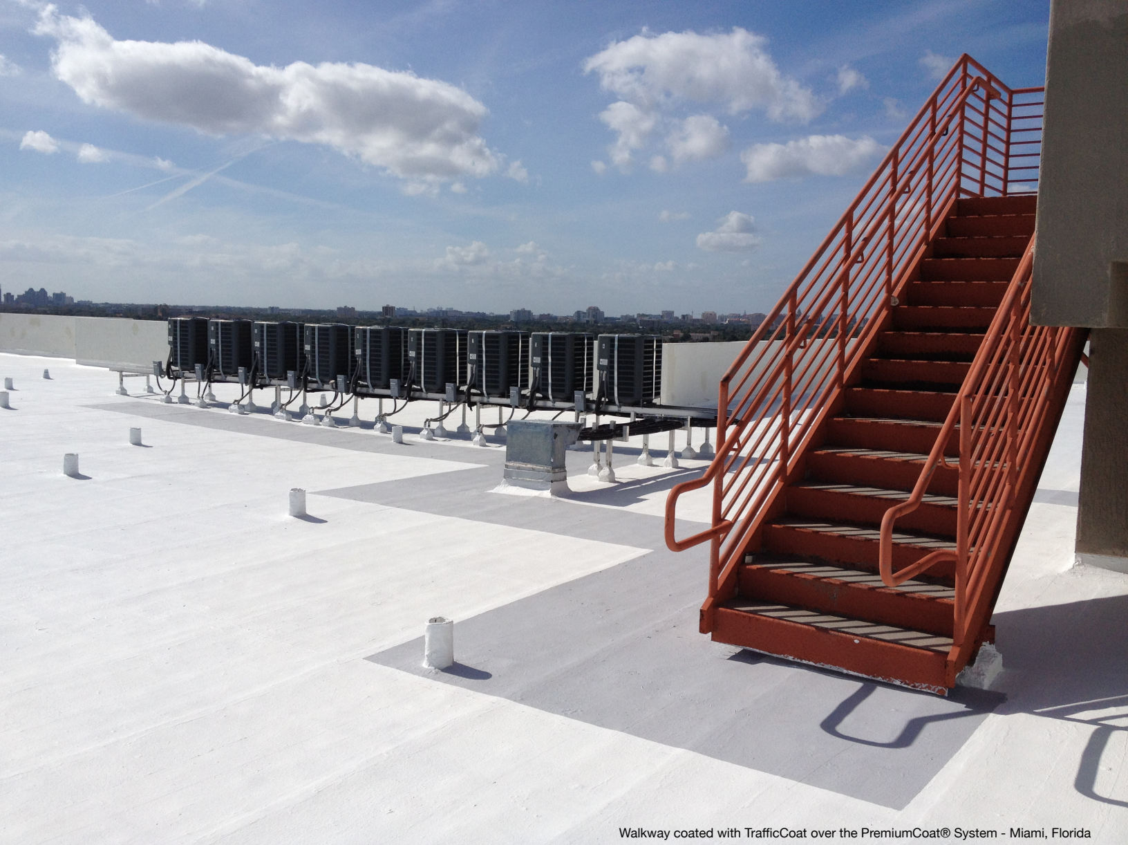
Walkway coated with TrafficCoat over the PremiumCoat® System - Miami, Florida