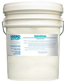
HYDROCLEAN™ Shipped in white pail with white lid. Available in 1-Gal jugs and 5-Gal pails.