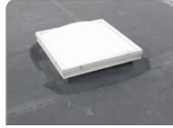
SINGLE-PLYS (TPO, EPDM...)