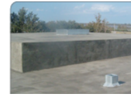
CONCRETE & LIGHTWEIGHT